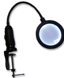
LED Dual Power Light with Magnifying Glass, VPN: 55615 1.45 lbs