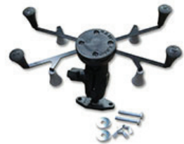
Splice Tray Holder VPN: 55725 .51 lb