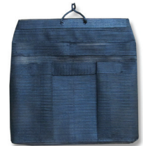
Black Poly-Mesh 3-Pocket Pouch, VPN: 55710 .15 lb