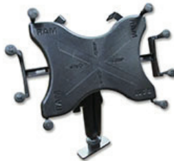
Tablet Holder VPN: 55720 1.71 lbs