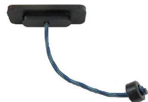
Splicer Seat Tether VPN: 55745 5 oz