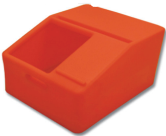
Splicer Seat VPN: 55430-OR 10 lbs