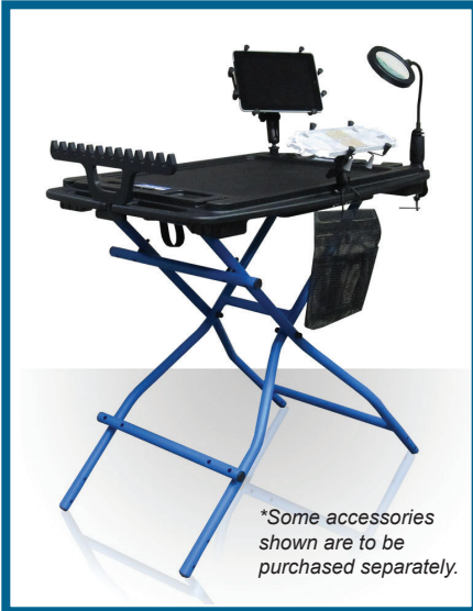
*Some accessories shown are to be purchased separately.