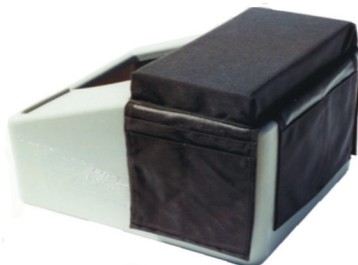
Tool Saddle with Pocket VPN: 558430-CU-BLK 14 oz