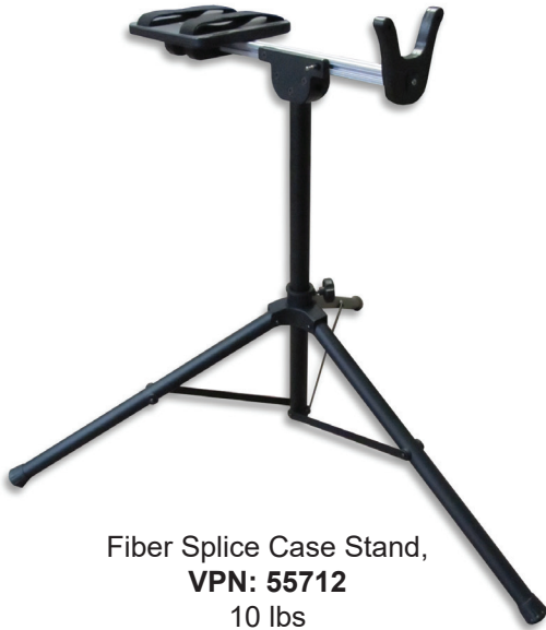
Fiber Splice Case Stand, VPN: 55712 10 lbs