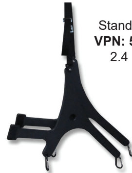
Stand-Offs VPN: 55711 2.4 lbs