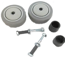
Wheel Kit VPN: 55740 10 oz