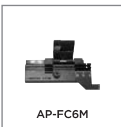
Single fiber adapter